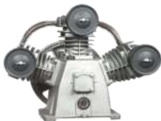
BREAKDOWN VIEW PAGE 30-31