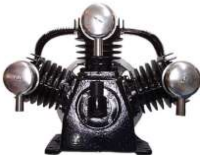
PT03A SINGLE STAGE