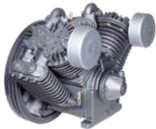
BREAKDOWN VIEW PAGE 28-29