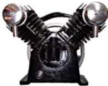
PV02A SINGLE STAGE