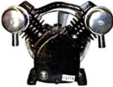
PV01A SINGLE STAGE