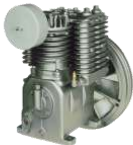
BREAKDOWN VIEW PAGE 26-27