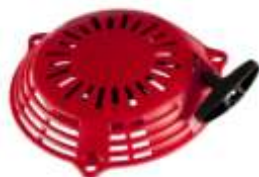
RECOIL START ASSEMBLY